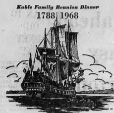
The Kables' invite 'on card.

Not much of a start for a nation, really: a convict settlement at the edge of nowhere, in a land where no crops grow, no beasts grazed, no buildings stood.